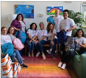
A large volunteer group from Bristol Myers Squibb helped to fill hundreds of backpacks with school supplies.