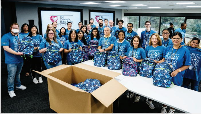
Bloomberg employees donated 500 backpacks to ensure CHSofNJ children and youths are ready for the new school year!

CHSofNJ simply could not make such a meaningful difference in our communities without the support of caring friends like you! We couldn't possibly share pictures of each individual who helps make our programs and services possible, but we are so proud to share this small sampling of volunteers, donors, partners, and friends. The outpouring of generosity for our 2023 Back to School Drive made it possible to meet the needs of 1,194 children – breaking all previous records! From the bottom of our hearts, thank you for helping us save children's lives and build healthy families.