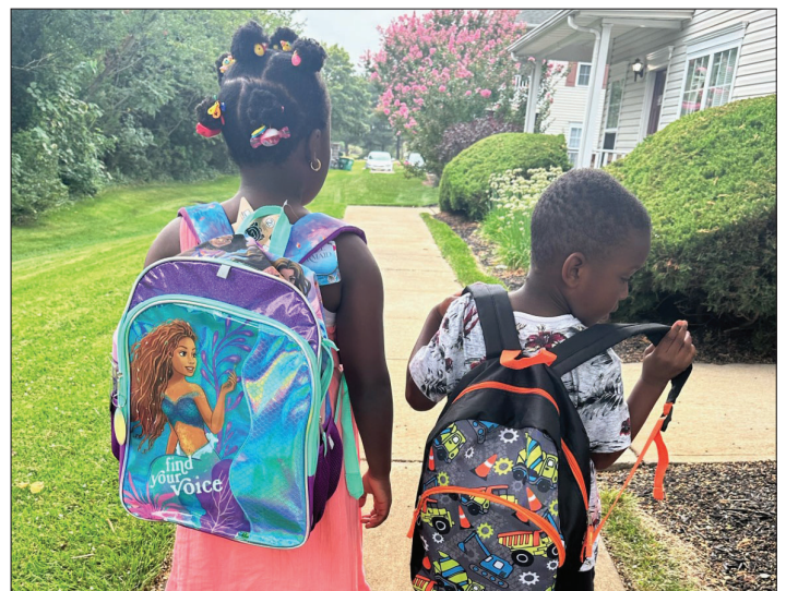
Two siblings walk to school with their new backpacks, well-prepared to learn thanks to generous CHSofNJ donors!