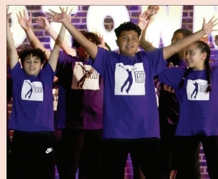
Pictured: Trenton Education Dance Institute (TEDI) students perform at the 2023 Event of the Year.

Visit www.chsfnj.org or call (609) 695-6274 to learn more about our fundraising events, donation drives, and so many other ways you can partner with CHSofNJ to Save Children's Lives & Build Healthy Families!