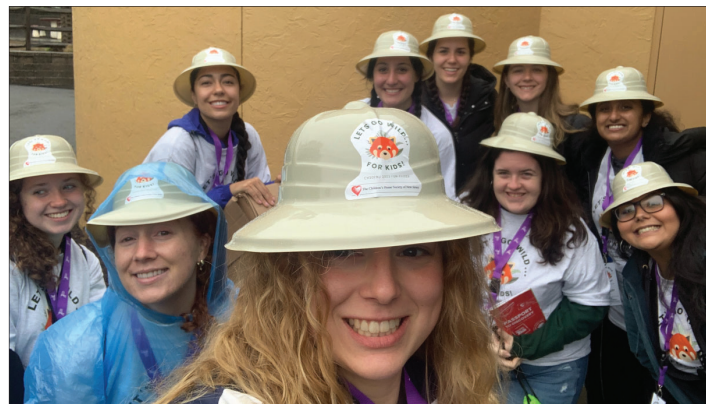
Volunteers from Seton Hall University don docent attire and safari hats as they help our guests navigate the zoo and our event.