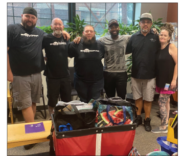
Members of 215 Mopar delivered a collection of backpacks for our children.