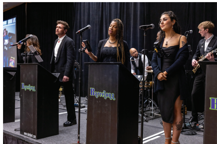
After the live auction, the lights dimmed and Barcelona's impressive repertoire brought guests to their feet, filling the dance floor.