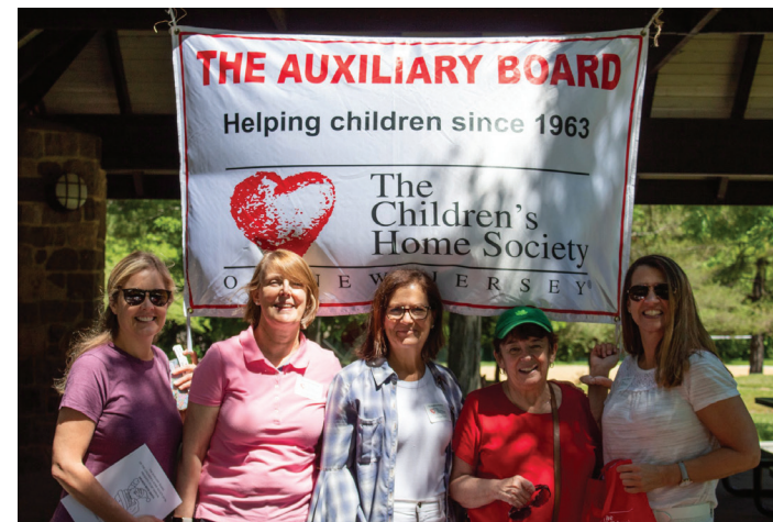
Auxiliary Board members enjoy a moment of down time before starting the Family Fun Walk at Veterans Park, Hamilton in June 2022.

After 60 years of enthusiastic and caring support, the Auxiliary Board of CHSofNJ has decided it is time to retire its charter. Since its inception in 1963, this dedicated and generous group of women raised nearly $700,000 that directly benefitted CHSofNJ services! From foster baby showers to beloved annual events including Santa's Wonderland/Brunch with Santa and designer Handbag Bingo, the Auxiliary's members worked hard to bring joy to our families. In addition to fundraising, many also knitted and crocheted baby outfits for our new mothers and delivered presents during our holiday drives. On behalf of our children, families, Board of Trustees, and staff, we will always be grateful for your extraordinary compassion, care, and generosity.