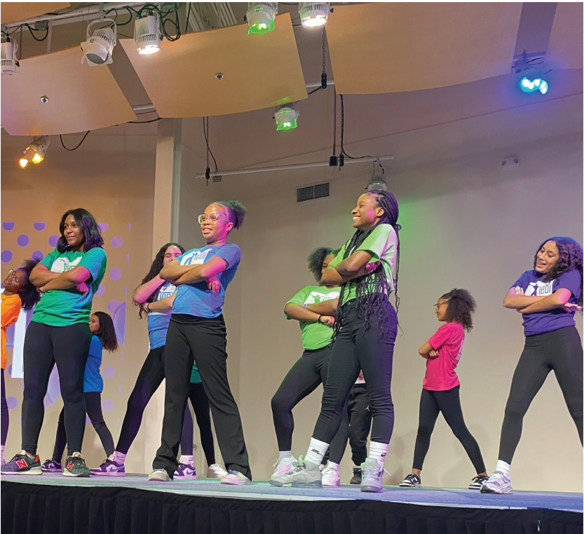
TEDI students followed their performance by responding to questions from the audience and sharing how TEDI has profoundly impacted their lives and perspectives.