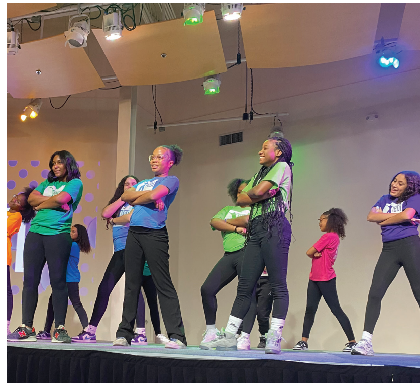
TEDI students followed their performance by responding to questions from the audience and sharing how TEDI has profoundly impacted their lives and perspectives.

Since 1989, Trenton Education Dance Institution (TEDI) has provided dance instruction in Trenton middle schools, encouraging confidence, resiliency, cognitive and physical skills, and team building efforts. CHSofNJ is proud to support TEDI and the life-changing outcomes they produce.