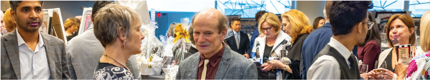
Guests peruse auction items while catching up with old friends and making new ones during the gala cocktail hour. This year’s annual gala recognized the agency’s 130-year history and was held at the Hyatt Regency Princeton on Saturday, April 6th.