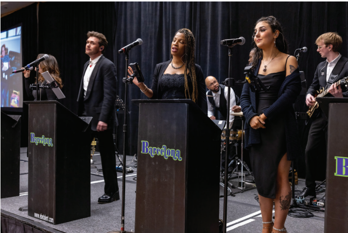
After the live auction, the lights dimmed and Barcelona’s impressive repertoire brought guests to their feet, filling the dance floor.