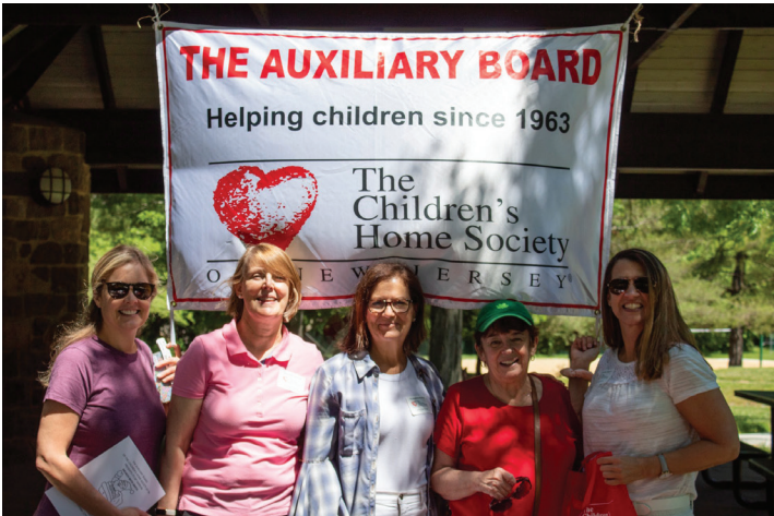
Auxiliary Board members enjoy a moment of down time before starting the Family Fun Walk at Veterans Park, Hamilton in June 2022.

After 60 years of enthusiastic and caring support, the Auxiliary Board of CHSofNJ has decided it is time to retire its charter. Since its inception in 1963, this dedicated and generous group of women raised nearly $700,000 that directly benefitted CHSofNJ services! From foster baby showers to beloved annual events including Santa’s Wonderland/Brunch with Santa and designer Handbag Bingo, the Auxiliary’s members worked hard to bring joy to our families. In addition to fundraising, many also knitted and crocheted baby outfits for our new mothers and delivered presents during our holiday drives. On behalf of our children, families, Board of Trustees, and staff, we will always be grateful for your extraordinary compassion, care, and generosity.