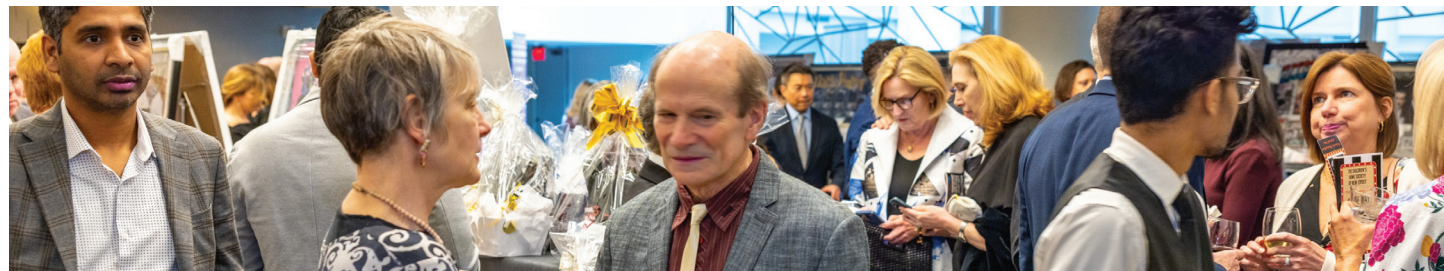
Guests peruse auction items while catching up with old friends and making new ones during the gala cocktail hour. This year's annual gala recognized the agency's 130-year history and was held at the Hyatt Regency Princeton on Saturday, April 6th.